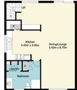
Granny Flat Downstairs