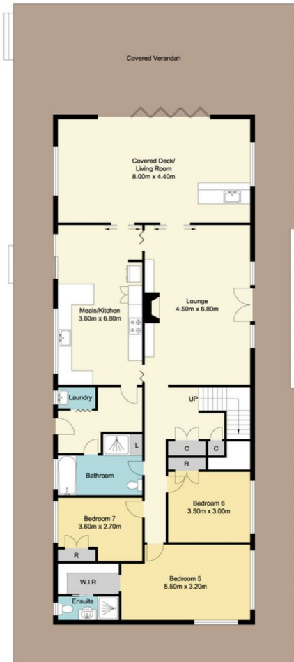
Residence Ground Floor