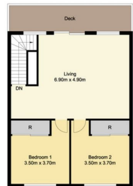
Granny Flat Upstairs