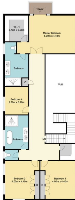
Residence First Floor