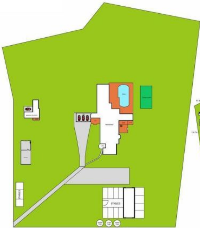
SITE PLAN AROUND BUILDINGS