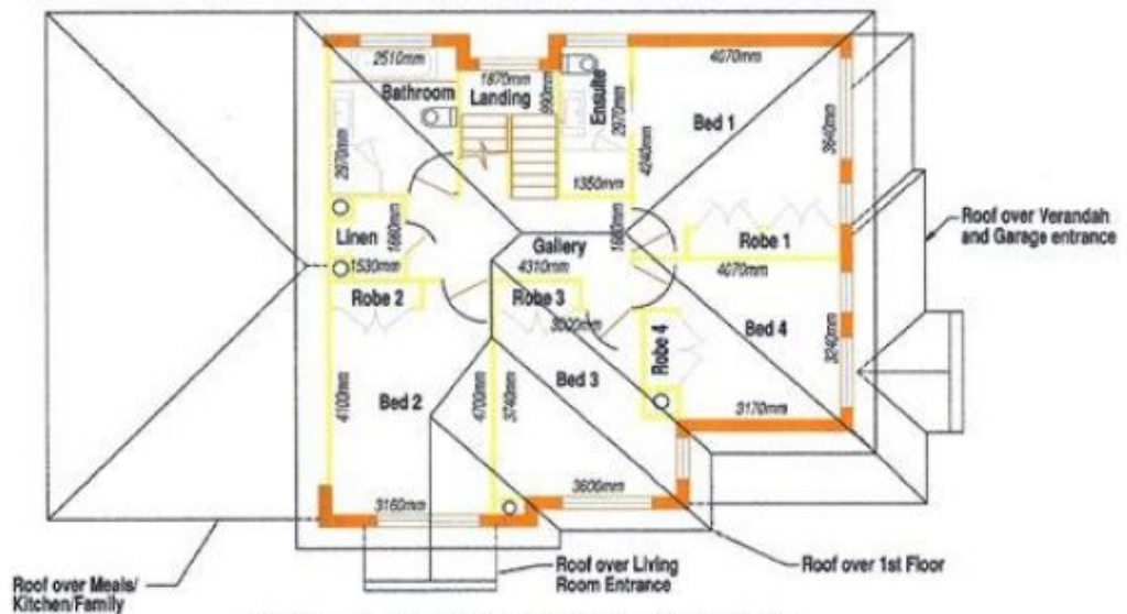
24 Lily Lane, Woongarah, NSW 2259 Allam Ettalong Corner Contemporary 1st FLOOR PLAN