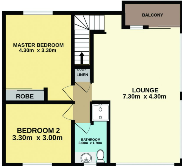
TOP FLOOR 60.2 sq.m. approx.