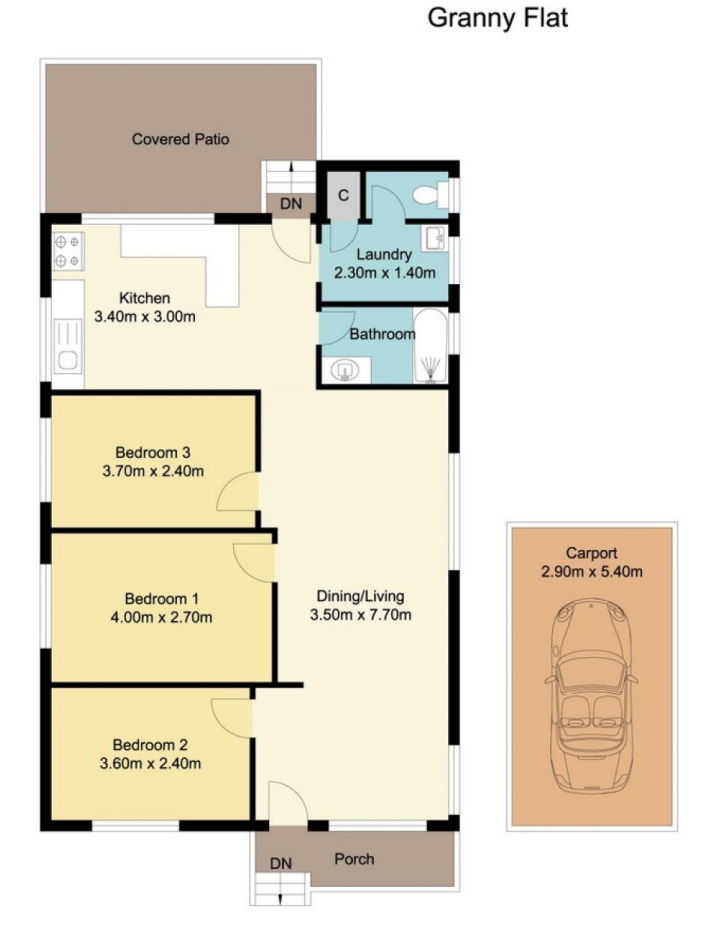
Residence Total Approx Floor Area 134.92 sq.m

Measurements are approximate. Not to scale. For illustrative purposes only. Boundaries are approximate