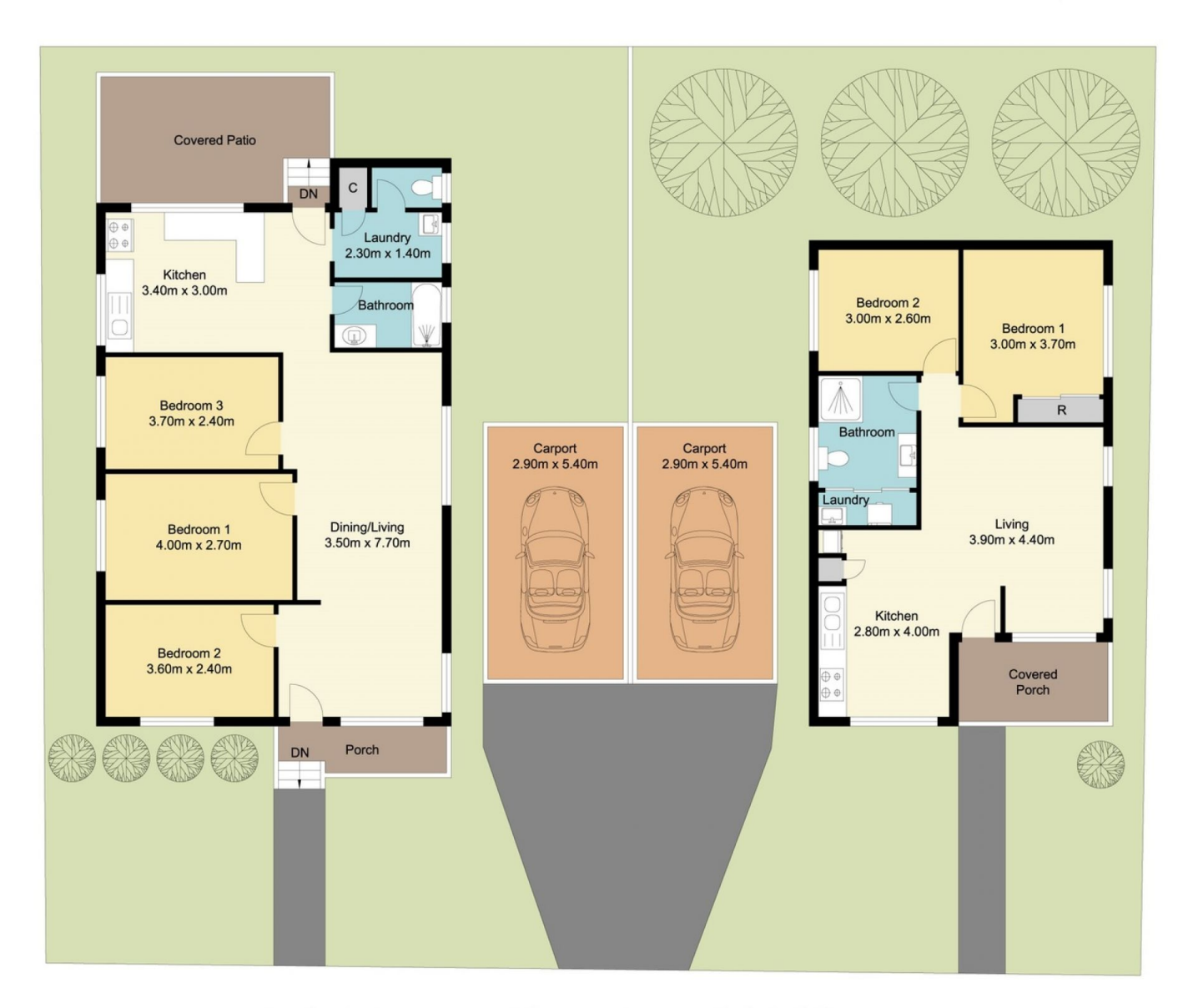
Total Approx Floor Area 134.92 sq.m